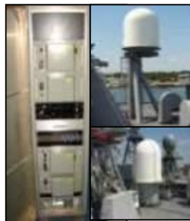
Tactical Control Data Link (TCDL)