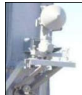
UCARS-V2 for Ship Launch/Recovery