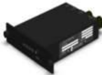
TACISR / Vortex